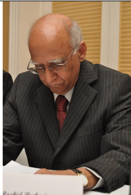
The Hon Ahmed Rashid BEEBEEJAUN, Deputy Prime Minister Government of Mauritius