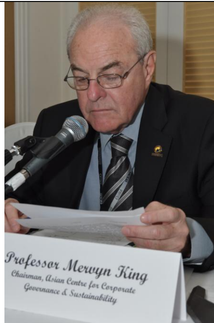
Mervyn King - Chairman - Global Advisory Board, Asian Centre For Corporate Governance & Sustainability