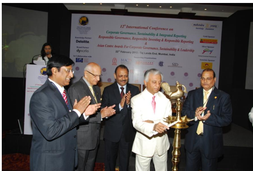
Shri T.K.A. Nair – Advisor to the Prime Minister, Government of India, lighting the inaugural lamp

Shri T.K.A. Nair - Advisor to the Prime Minister of India, inaugurated the conference and delivered a keynote address on the theme 'Governance that India needs'.