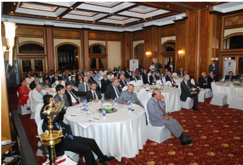
The audience in rapt attention at the 12 th International Conference.