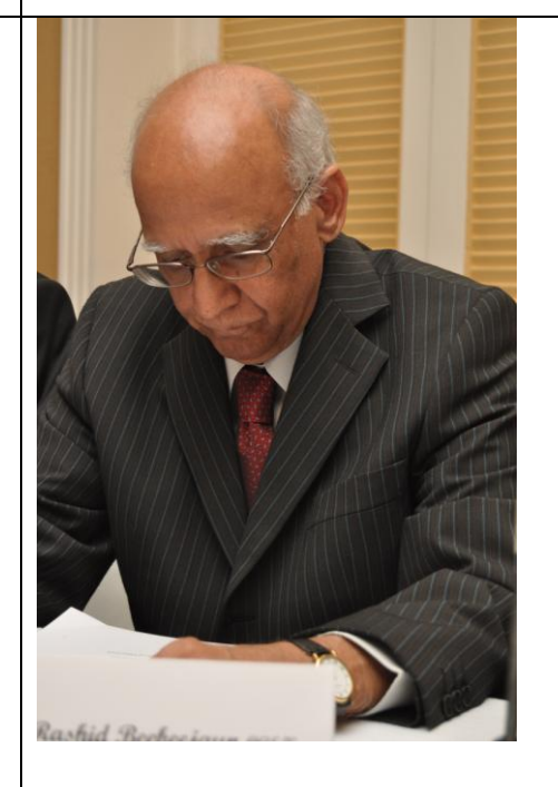
The Hon Ahmed Rashid BEEBEEJAUN, Deputy Prime Minister Government of Mauritius