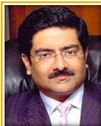
Kumar Mangalam Birla - 2011