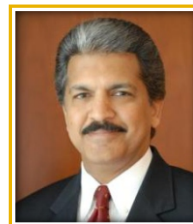
Anand Mahindra 2012