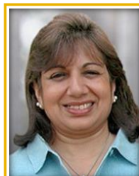
Kiran Muzumdar Shaw 2011