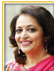
Swati Piramal 2009