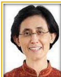
Vinita Bali 2010