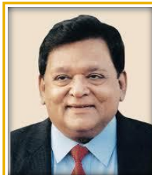
A.M. Naik 2008