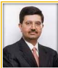
Uday Kotak 2015