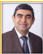
Vishal Sikka 2016