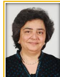
Zia Mody 2006